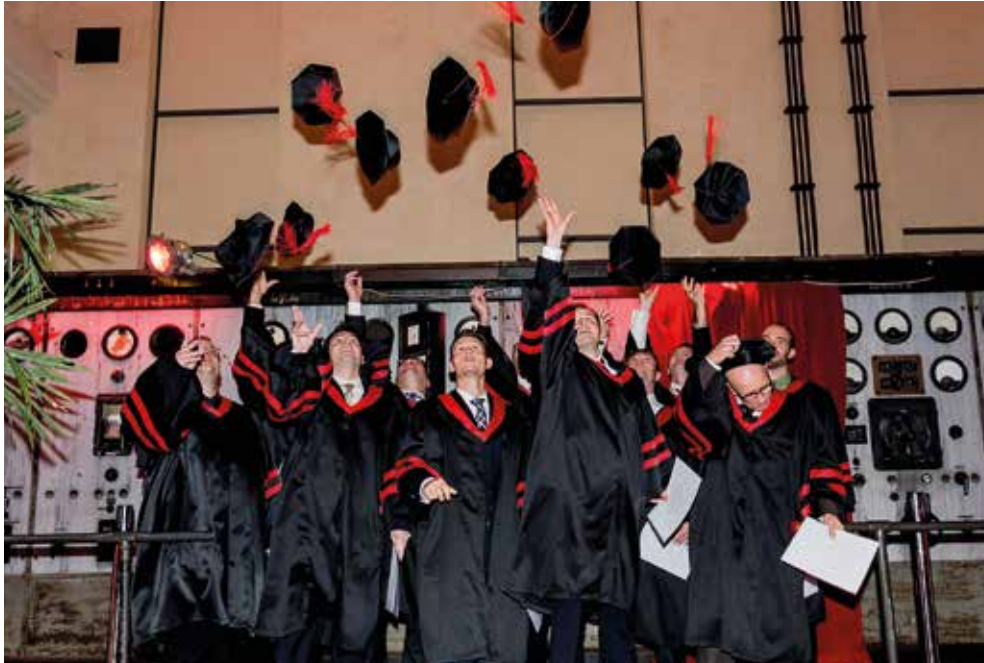
< Executive MBA Graduation Ceremony